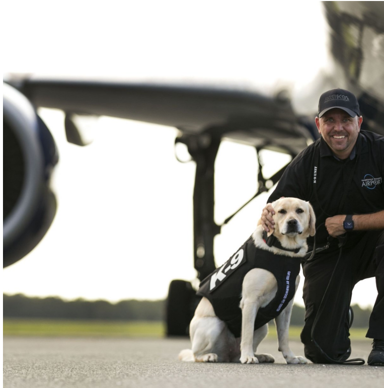
Name: Beamer Title: K-9 Explosives Detection Dog for Gainesville Regional Airport Breed: Yellow Labrador Retriever Born: February 9, 2017, Colombia, South America